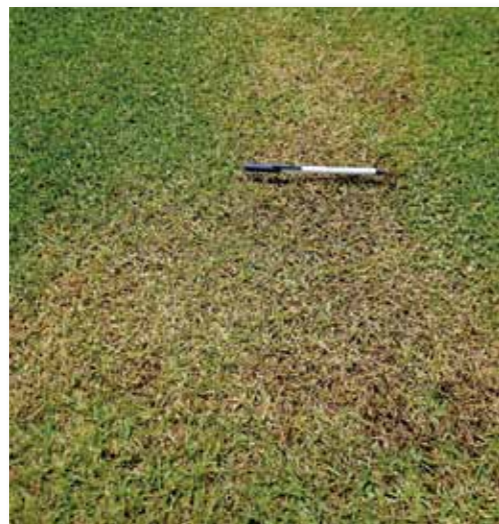
Dry patch in kikuyugrass under 60 per cent ET-replacement irrigation during summer